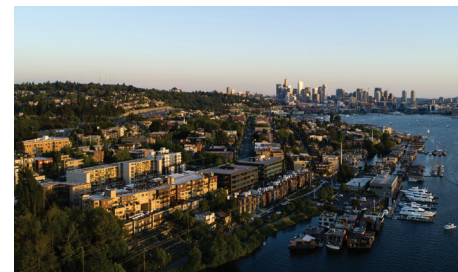
Easttown Lofts in the heart of the Eastlake neighborhood, is the perfect place to work and play.

Generations of Seattle's workers and families have called the Eastlake Neighborhood home. Today, it is a vibrant community with cafes, shops, family homes, townhouses, condominiums and apartments. Close to downtown Seattle and all that it offers, the Easttown Lofts in the heart of the Eastlake is the perfect place to live. With private individual entrances, high quality designer fixtures and surfaces, top-of-the-line appliances, advanced environmental and safety controls, the Easttown Lofts is all about Neighborhood and home done well.