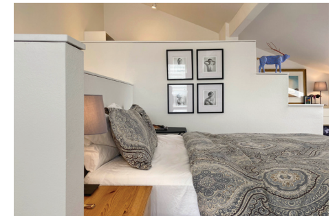
Easttown's West Loft Building offers one bedroom lofts with plenty of room to stretch out and relax.